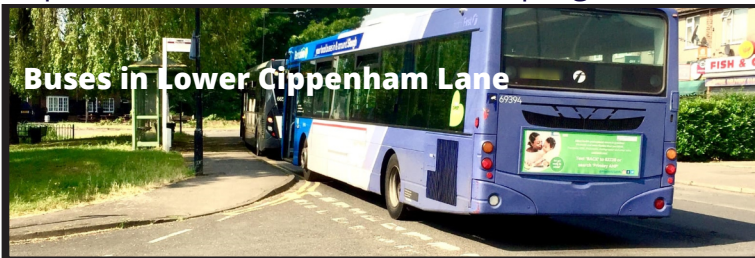
Buses in Lower Cippenham Lane